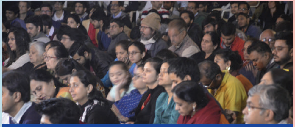
Music enthusiasts enjoying a show