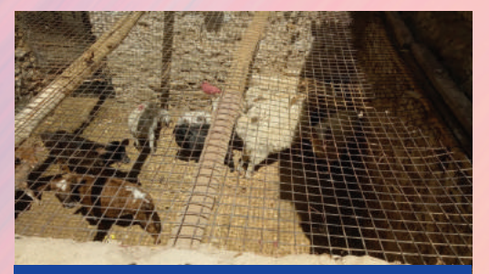
A corral pen protecting livestock