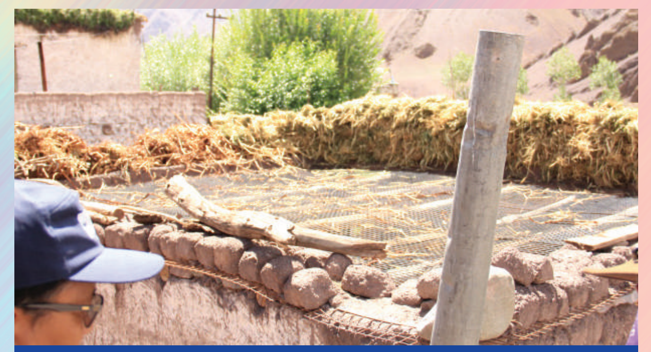
A recently completed predator-proof corral in Shang village in Ladakh

These activities have benefitted 12 villages, 15 families of 70 members and a cattle population of 1350. The awareness programs have reached out to 500 individuals in the region.