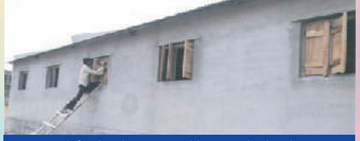
Infrastructure support to a rural school