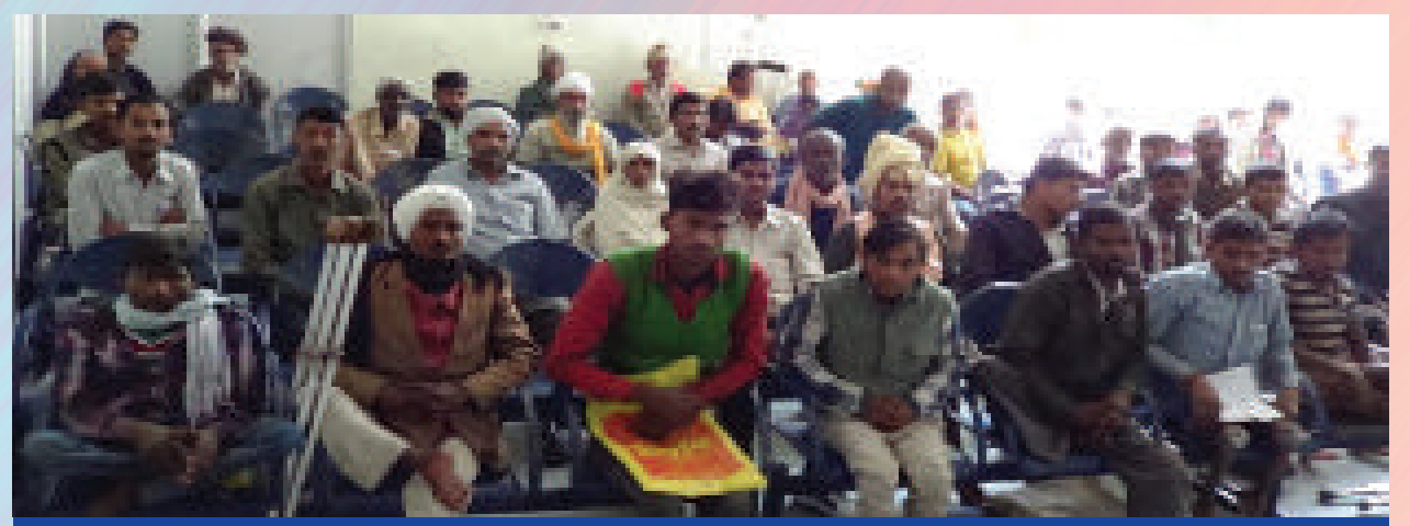
Rehabilitation of the physically disabled