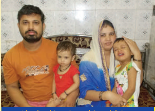
Medical treatment for children with serious ailments