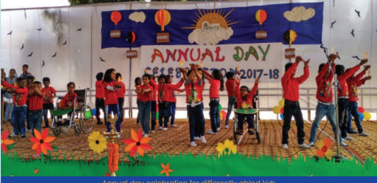
Annual day celebration for differently abled kids

Our hands-on approach enables us to contribute to and effectively support the progress of our outreach initiatives that serve those in need.