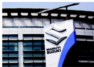
MUTED MARKET SHARE

What will be crucial is the pace of growth for the SUV segment where the company has launched the Grand Vitara, the Jimny, and the Fronx in the past six months. The company lost market share over the past few years and its stock underperformed peers due